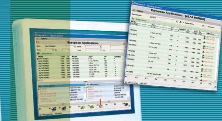
Knowing the ElecSys programme in greater detail:

Publisher is a program that allows the user to simulate a paper catalog with a simple and intuitive interface.