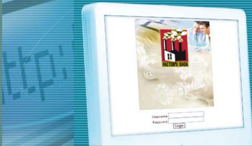
New projects: on-line tools and utilities